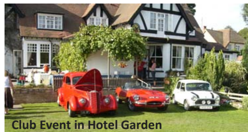
Club Event in Hotel Garden

The hotel has dedicated one of its bars to the local clubs in the area. We love a good excuse for a get-together and as a result we now have many clubs visiting us on a regular basis. Wheels to propeller, we have a healthy selection meeting here. For an up-to-date timetable of when the various clubs meet with us, take a look at our website www.foxcombelodge.com . If you have a club or know of a club that needs a meeting place, let us know.