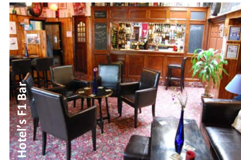
Hotel's F1 Bar

week to both residents and non-residents. The hotel also offers two bars. One is themed to Formula 1 racing and the other is decorated with memorabilia of the various clubs that meet with us.