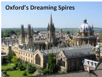
Oxford's Dreaming Spires