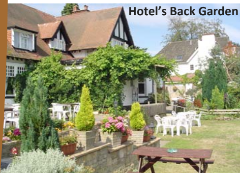
Hotel's Back Garden